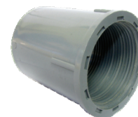
Concrete Housing for UL-P50 Light