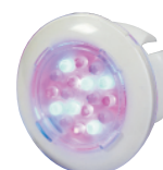
Auto Color Change